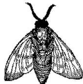
Figure 2: A sample black and white graphic (.eps format) that has been resized with the epsfig command.

close the table’s contents and the table caption. As with a single-column table, this wide table will “float” to a location deemed more desirable. Immediately following this sentence is the point at which Table 2 is included in the input file; again, it is instructive to compare the placement of the table here with the table in the printed dvi output of this document.